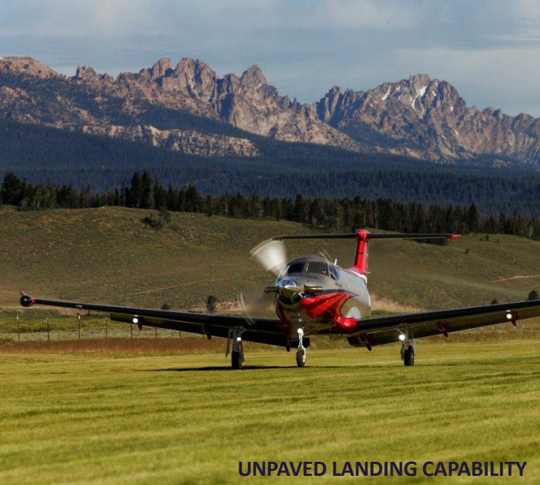
UNPAVED LANDING CAPABILITY